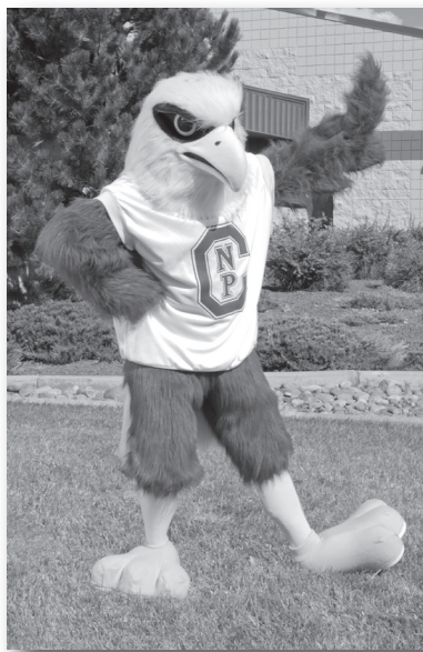
NPC Mascot Ernie Eagle

Ernie Eagle represents the college at community and college events and on social media websites. Be sure to join over 1,500 of Ernie's friends on Facebook. Ellie Eaglet is the spokeseagle for the Kids College program.