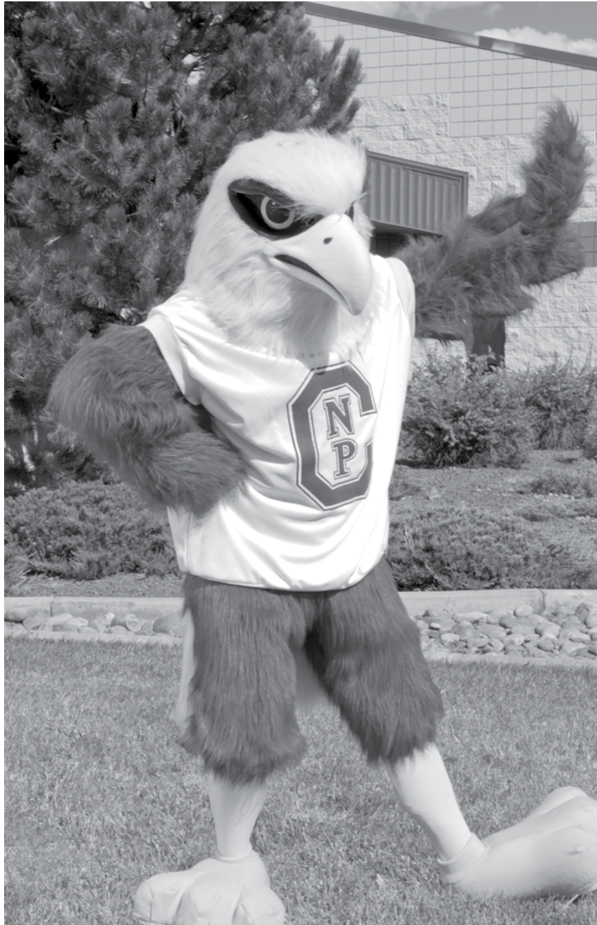
NPC Mascot Ernie Eagle