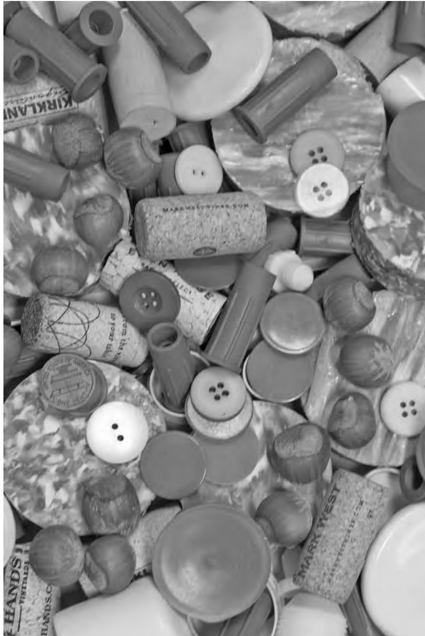
Loose parts like these encourage creative play in young children. This mixture of natural and man-made objects were used in a workshop for Early Childhood educators.