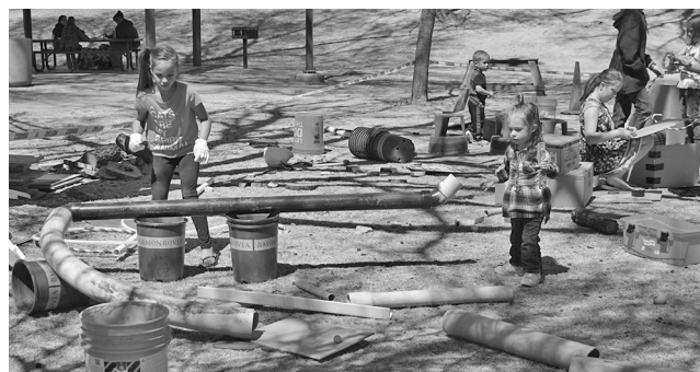
Youngsters demonstrate creativity playing with “loose parts.”

The AAS in Early Childhood Studies is an appropriate option for individuals interested in pursuing a career working directly with, or on behalf of, young children and who may not wish to attain teacher certification and/or endorsement. Examples of some of the early childhood professions and organizations that do not require certification include: Head Start, home visitation programs, parent education programs, early intervention and others. The AAS degree does not supply the AGEC (see page 62) requirements for university transfer to a BA or BS degree, but may support pursuit of a Bachelor of Applied Science (BAS) degree at each of the three state