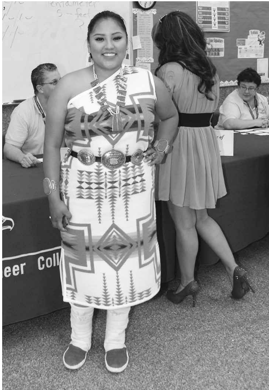
A Class of 2016 member, in her native dress, prepares to check-in at the Commencement ceremony.