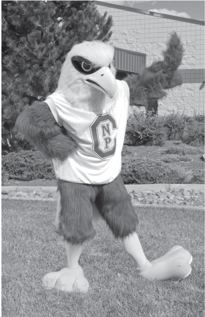
NPC Mascot Ernie Eagle