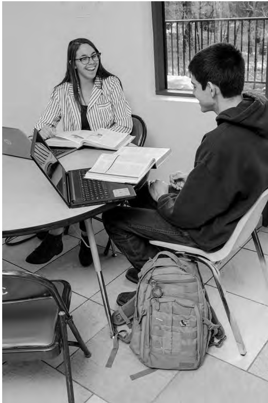
Studying together has been proven to improve grades.